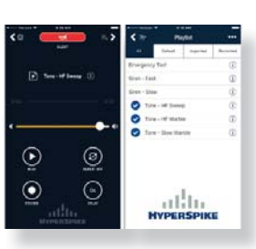
HyperSpike Phone App